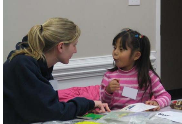
An adult volunteer tutoring a young immigrant student

denied opportunities because they are stuck in dead-end remedial classes which focus on repetitive drills and not on interesting and challenging mathematics. What a loss to our society.