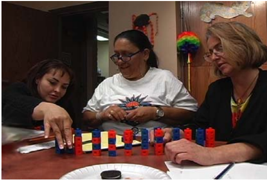
Parents learning mathematics at one of the tertulias matemáticas