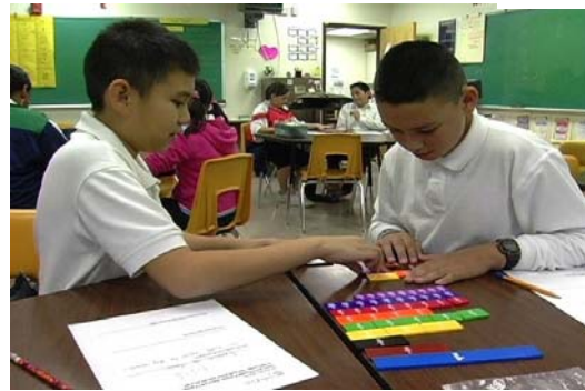
Students justifying their solution with fraction bars

The lesson involved addition of fractions with unlike denominators, which the middle school students had not worked on yet this year. The students first given the following word problem, " Cecilia uses \frac{2}{6} pound of cheddar cheese and \frac{1}{4} pound of mozzarella cheese to make nachos. How much cheese does she use in all? " The students were initially given time to think independently. Most of them readily added the fractions by adding the numerators and by adding the denominators, and wrote down a solution of \frac{3}{10} . After discussions took place among partners, only a few pairs of the students changed their solutions to \frac{7}{12} , recognizing that it was necessary to find a common denominator. It was not until additional tools were given to students as the lesson evolved, namely fraction bars, did students begin to think critically about their methods since they had to "justify" their solutions with the fraction bars. It was at this point that most of the students were able to make connections between the fractions, the fraction bars, and the meaning behind the need to find a common denominator.