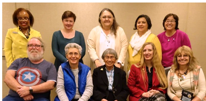
Some TODOS members synchronized their smiles for a picture taken at the end of the TODOS business meeting on April 13, 2016.